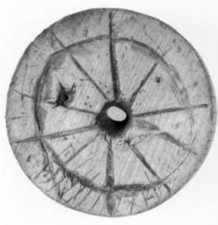
Figure 6: Oslo. (Kulturhistorisk Museum, Oslo, C31266h)