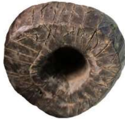
Figure 10. East Lindsey, Lincolnshire. (Daubney 2010)