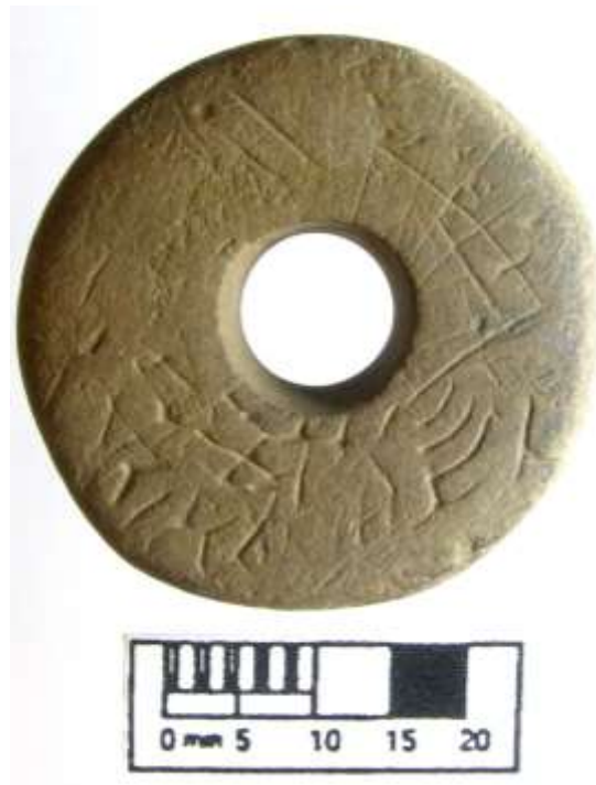
Figure 1: Lair Spindle Whorl

The following is an examination of a stone spindle-whorl (SF33, Figure 1) found in 2015 during excavation at Lair, Glenshee, in northeast Perth and Kinross. The site consists of several Pictish stone and turf longhouses of the Pitcarmick type, dating from broadly the 7 th -10 th centuries AD (D Sneddon pers. comm., 26 October 2016). The spindle-whorl was found in the western end of Building 3, Trench 23, within an artefact-rich occupation layer along with pottery (SF27), flint (SF37), pieces of burnt bone (SF38), a possible iron knife (SF 40) and other corroded pieces of iron (SF36) (Strachan & Sneddon 2015, 21). Radiocarbon dating puts Building 3 within the range of AD 680 to 965 placing the spindle-whorl solidly within an early medieval context. The sandstone whorl is complete with a circular profile and relatively flat sides giving it a rectangular cross section. The object measures 36 mm in diameter, ranges from 4 to 8 mm thick and weighs 16.2 g. There is a single central hole measuring approximately 11 mm in diameter. The whorl is made of a beige, fine-grained sandstone not native to the Glenshee area (E Campbell pers. comm. 27 October 2016) which may have come from a region of red sandstone 25 km south of the site.