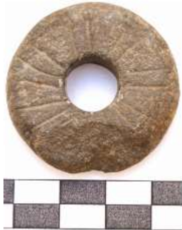
Figure 5: Fintray, Aberdeenshire. (British Museum, 1906,0421.202)

An apparently unpublished stone spindle-whorl found in Fintray, Aberdeenshire (Figure 5) (British Museum 1906, 0421.202) has similar radial lines expanding out from the central perforation but without a central stem line. This spindle-whorl is dated from the Neolithic to Bronze Age illustrating that this type of linear decoration may be widespread. There are a high number of spindle-whorls from Scandinavia of varying shapes with renditions of this type of decoration. These include a cylinder-shaped one from Jæren, Rogaland county, Norway (Arkeologisk Museum, Stavanger, S1531), a dome-shaped whorl from Voss, Hordaland, Norway (Universitetsmuseet i Bergen, B6288r) and a disc-shaped wooden spindle-whorl from Oslo (Figure 6) that also displays a runic inscription (Kulturhistorisk Museum, Oslo, C31266h; MacLeod & Mees 2006, 51). A conical spindle-whorl from Kvam, Hordaland, Norway (Figure 7) (Universitetsmuseet i Bergen, B14979_1) has three horizontal lines circling around its sides and is nearly identical to a steatite whorl from Jarlshof, Shetland (National Museums Scotland, X.HSA 422; Treasure Trove, TT 8/07) which is decorated with a horizontal groove running through linear incisions (Heald 2007, 175). From Jarlshof and Dunrossness, Shetland are a number of Pictish stone discs with intricate designs and ambiguous carvings resembling the markings on the Glenshee spindle-whorl (Figure 8, Scott & Ritchie 2009, 16-17; National Museum of Scotland GA.425).