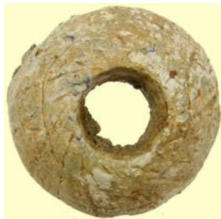
Figure 4: Colchester, Essex (Colchester Treasure Hunting)