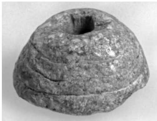
Figure 7: Kvam, Hordaland, Norway (Universitetsmuseet i Bergen, B14979_1)