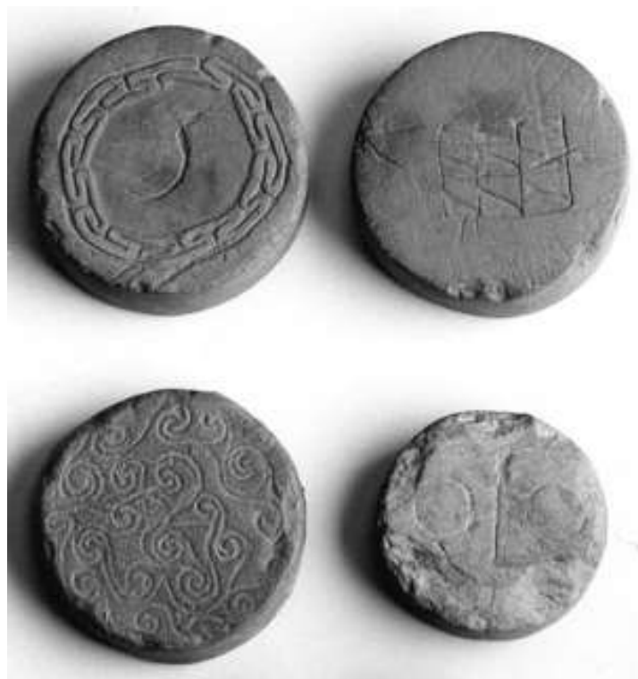
Figure 8: Scatness, Dunrossness, Shetland (Top row). Jarlishof, Sumburgh, Shetland (Bottom row) (National Museum of Scotland, GA.425)