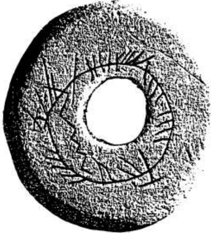
Figure 9. Buckquoy, Birsay, Orkney. (Forsyth 1995, 685)